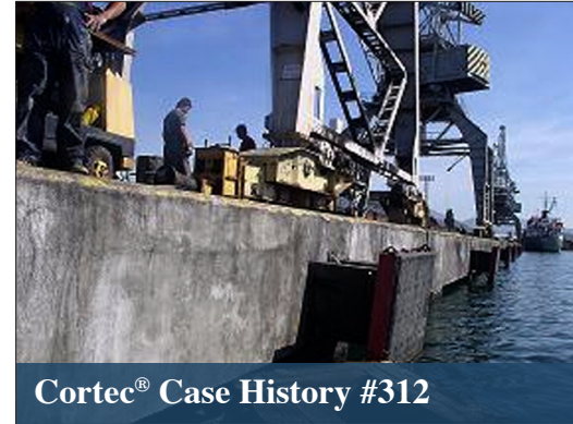
Cortec® Case History #312

CorteCros Co. Ltd., Croatia was founded in 1998 as a joint venture between Crosco, Integrated Drilling & Well Services Co. Ltd., a member of INA Group, and Cortec® Corporation, USA. CorteCros is the Distributor for Cortec® in Croatia and South-Eastern Europe. They have offices located in Zagreb, Croatia and a distribution center in Kaštel Sućurac near Split, Croatia. This distribution center is also the customs clearing warehouse for all Cortec® products distributed in Europe. This joint venture was set up to expand the potential of Cortec's environmentally friendly corrosion control products and applications in the South East European market. Today CorteCros still provides these performance-enhancing solutions to serve the diverse needs of their customers.