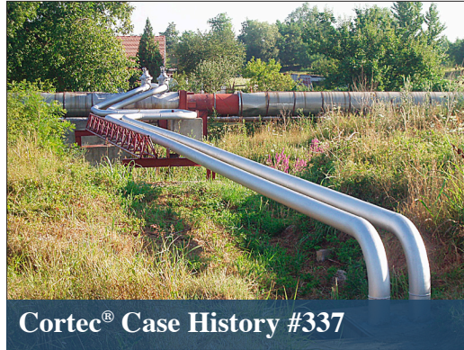
Cortec® Case History #337